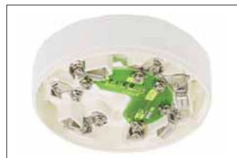
Detector base with relay card for direct connection to a 48 V DC voltage supply