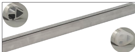
Venturi pipe for IQ8Quad air duct module

In addition, new air duct pipes have been developed. Sophisticated design allows optimum usage of air streams within the channel in order to guarantee optimum detection with the IQ8Quad OT blue DSD.