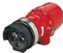
X-Series Weather Shield