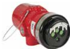
X3301 Multispectrum IR Flame Detector