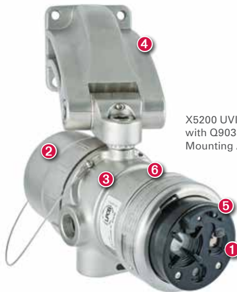
X5200 UVIR Flame Detector with Q9033B Stainless Steel Mounting Arm