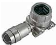
FlexSonic® Acoustic Leak Detector