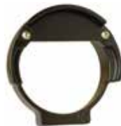
Field of View Limiter/ Weather Shield