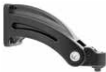
Aluminum Mounting Arm