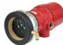
Universal Air Shield Assembly