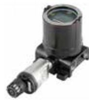
FlexVu® Universal Display with GT3000 Toxic Gas Detector