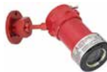
xWatch Explosion-Proof Surveillance Camera