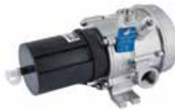
PointWatch Eclipse® IR Combustible Gas Detector